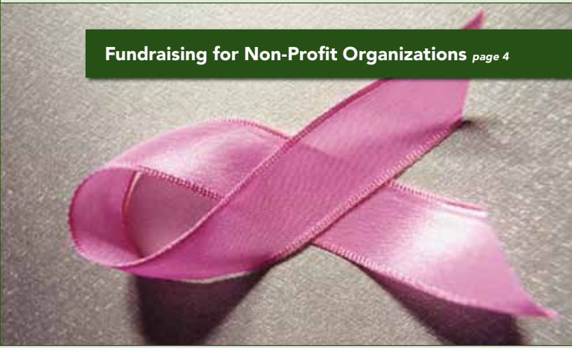
Fundraising for Non-Profit Organizations page 4

Learn how to be a fundraiser. Explore new territory prospect development, donor cultivation and stewardship, special events, online auctions, e-newsletters, partnering with board members and key stakeholders, obtaining sponsorships, creating and using social media (LinkedIn, Facebook, Twitter, Pinterest), annual and holiday