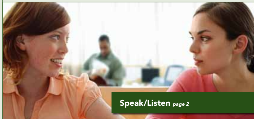
Speak/Listen page 2

Before BSL students can enter academic ESL courses, they must take a placement test in the Assessment Center, Room B118.