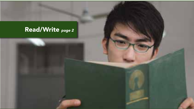
Read/Write page 2