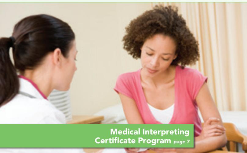
Medical Interpreting Certificate Program page 7

professional settings; sight translation; consecutive and simultaneous interpreting practice; role playing and note-taking techniques; readings in the field; exercises for building memory and concentration; discussion of practices, standards, and ethics; vocabulary in the medical field; advice on how to find and keep a job as an interpreter. This course is open to all languages, but students must be able to fully comprehend and communicate in both English and at least one other language. Because a selective interview is required before acceptance, students must register at least 2 weeks in advance. The College will issue a certificate upon satisfactory completion of this course, and participants receiving a certificate will be given the opportunity to interview with Transfluenci for potential employment as interpreters. This program meets requirements of the International Medical Interpreters Association (IMIA) for national certification. Prior to acceptance into the course, the student must take a brief oral language proficiency test by phone.