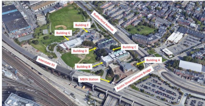
Graphic I: Aerial View

The Site consists of six interconnected campus buildings, with a seventh building currently under construction. The original campus, Buildings A, B, C, D, E and M (not shown) were completed between 1973 and 1979. Building G was constructed in 2009 and the Student Success Center (not shown) is currently under construction with an estimated completion date of 2024.